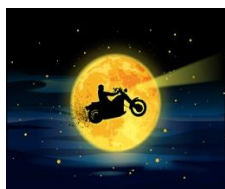
Chapter Director Mel Craven

We would like feedback on a possible weekend ride. Jana and I have plotted out a ride that would take us thru Lewiston to Hwy 12 with an overnight stop in Lolo Hot Springs, they have camping or cabins available. The return trip would take us thru Missoula and north on Hwy 200 to Sandpoint where we could come back thru Newport and south on Hwy 2 back to Spokane. Is this something we would like to do as a group? It is of course a summer ride because of the elevation of Lolo Pass. The feedback we are looking for is not route oriented, but participation oriented.